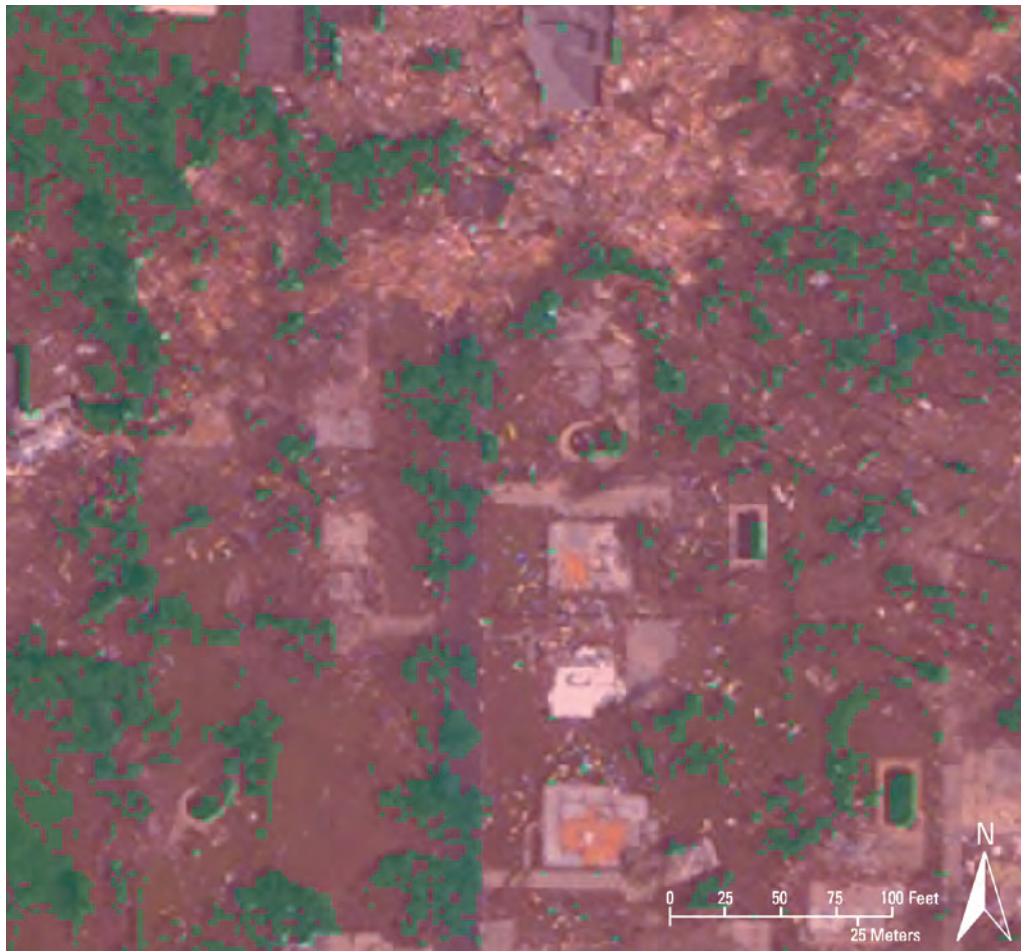
Figure 4. Grid raster masks representing results of image classification overlain on post-Hurricane Katrina photograph. Green pixels represent the areas classified as vegetated, and red pixels indicate the nonvegetated areas.