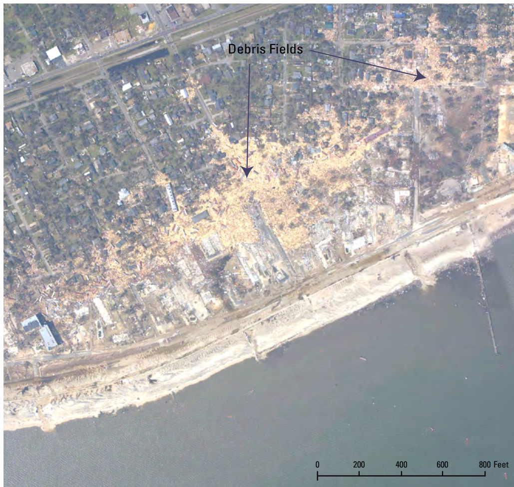
Figure 3. National Oceanic and Atmospheric Administration post-Hurricane Katrina photograph of Gulfport, Miss., showing “debris fields” of materials from destroyed buildings.

number of nonimpacted roof tops and level areas (parking lots and some roads) were classified as vegetation. This error did not present a problem for these analyses since the elevation difference in these misclassified areas is zero and does not contribute to the volumetric estimates.