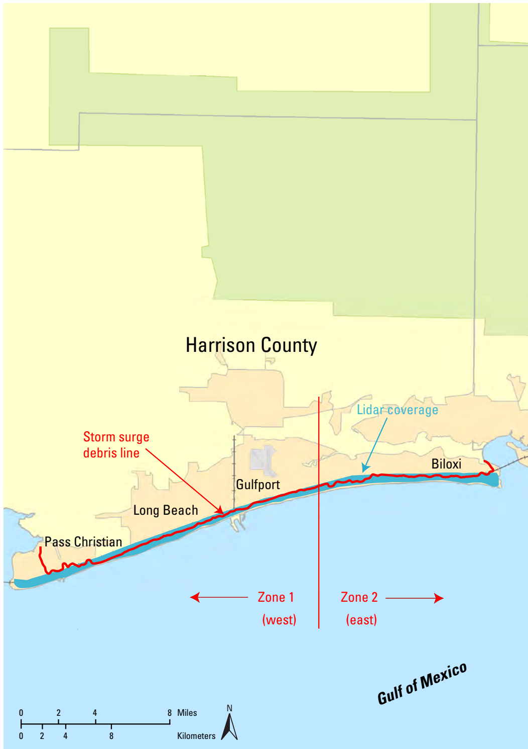
Figure 1. Location map of the Mississippi coast after Hurricane Katrina in 2005 with computational zones for debris-volume estimates in red. Light detection and ranging (lidar) coverage is represented in blue, and the storm surge debris line is represented in red.