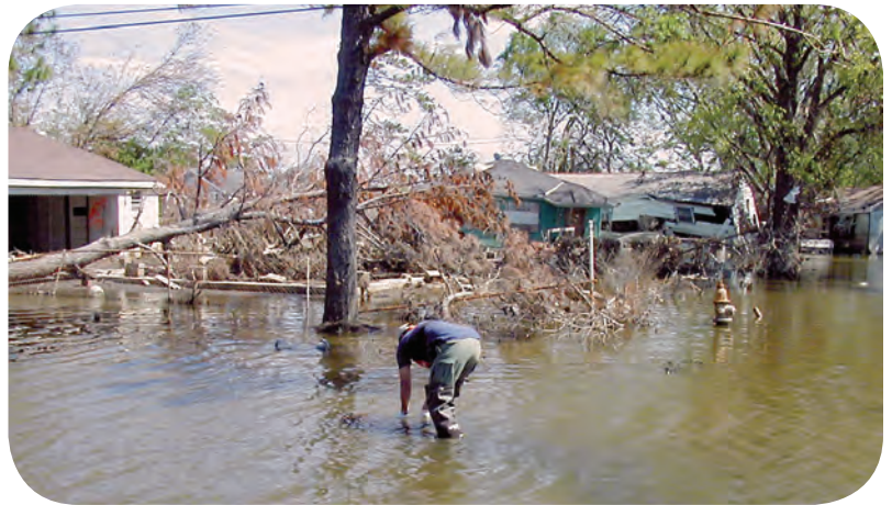
Figure 3. Water sample collection in the Lower Ninth Ward, New Orleans, La., October 6, 2005.

copper, lithium, manganese, molybdenum, nickel, selenium, strontium, vanadium, and zinc were detected in at least one sample from each site, and aluminum, antimony, lead, iron, and silver were detected in samples from about half of the sites.