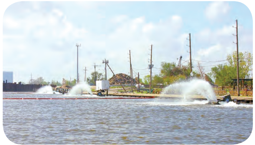
Figure 2. Aerators on the Metairie Outfall Canal (popularly known as the 17th Street Canal) near Metairie, La., September 29, 2005.

Metals were detected in samples from each site, but copper, nickel, and silver were the only contaminants detected in concentrations exceeding criteria for the protection of aquatic life in salt water established by the EPA. Copper was detected in samples collected from all sites except for the flooded street sample collected in the Lower Ninth Ward (fig. 3); concentrations exceeded the criterion continuous concentration (CCC), 3.1 \mu\text{g/L} , for salt water (U.S. Environmental Protection Agency, 2002) in 26 of the 28 samples for which copper was analyzed. Concentrations above the CCC may result in adverse effects on aquatic communities. The greatest copper concentration, 18.3 \mu\text{g/L} , was detected in a sample collected from the Gulf Intracoastal Waterway. The CCC for nickel in salt water (8.2 \mu\text{g/L} ) was exceeded in samples collected from Jahncke Canal (18.9 \mu\text{g/L} ), Bayou St. John (11.2 \mu\text{g/L} ), and the Gulf Intracoastal Waterway (11.6 \mu\text{g/L} ). Silver concentrations in samples collected from Chef Menteur Pass and the Gulf Intracoastal Waterway exceeded the criteria maximum concentration (CMC), 1.9 \mu\text{g/L} . The CMC is an estimate of the greatest concentration to which an aquatic community can be exposed briefly without resulting in an unacceptable effect (U.S. Environmental Protection Agency, 2002). Arsenic, beryllium, boron, chromium, cobalt,