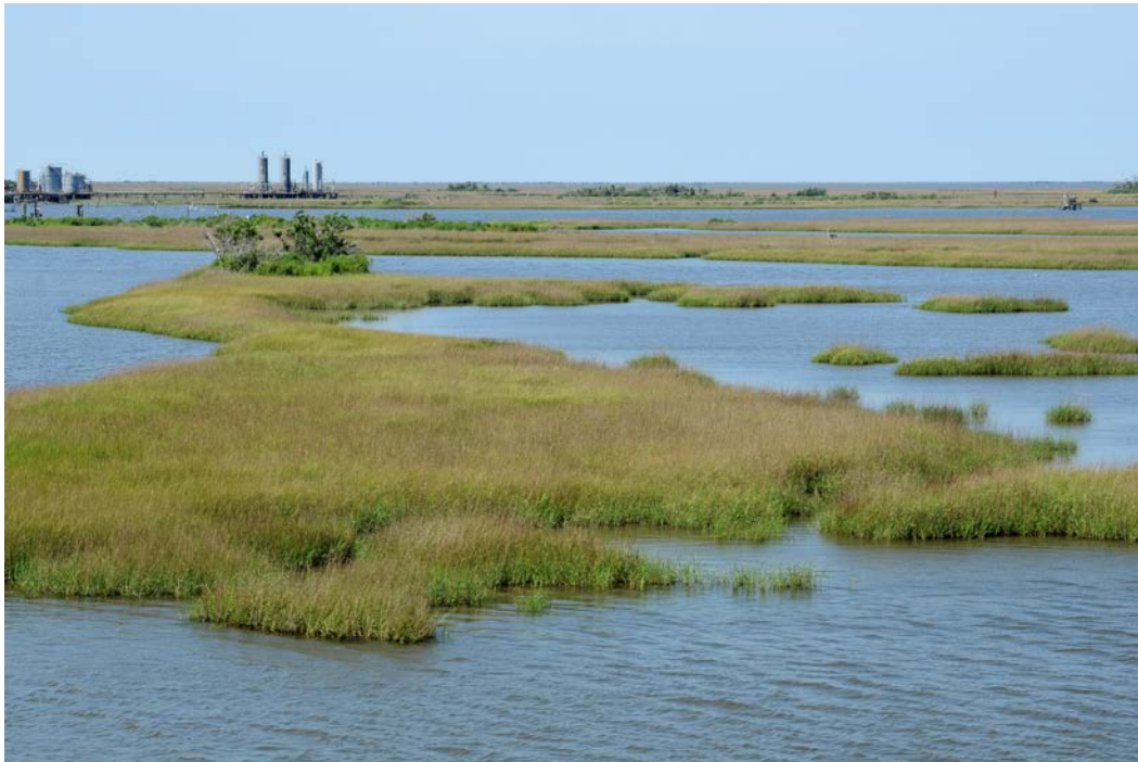
Coastal marsh near Leeville, Louisiana.

Workshop on Response of Louisiana Marsh Soils and Vegetation to Diversions