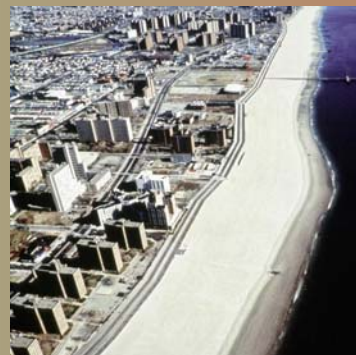
CONEY ISLAND BEACH RENOURISHMENT