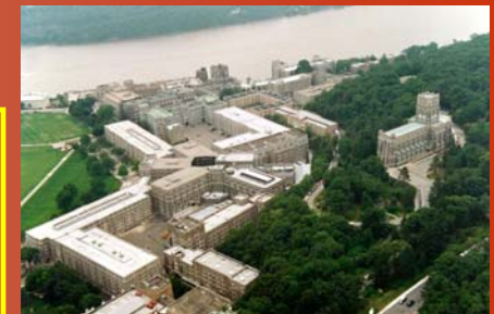
US MILITARY ACADEMY, WEST POINT, NY