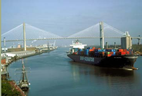
USACE NAVIGATION PROGRAM