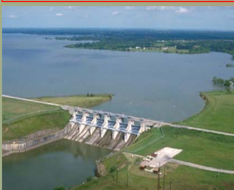
USACE FLOOD RISK MANAGEMENT