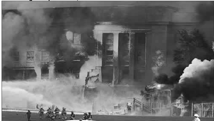
The Pentagon in Flames Moments after International Terrorists Crash a Hijacked Aircraft into the Building on September 11, 2001

GAO found considerable variation in the extent to which the seven strategies related to combating terrorism and homeland security address the desirable characteristics. A majority of the strategies at least partially address the six characteristics. However, none of the strategies addresses all of the elements of resources, investments, and risk management; or integration and implementation. Even where the characteristics are addressed, improvements could be made. For example, while the strategies identify goals, subordinate objectives, and specific activities, they generally do not discuss or identify priorities, milestones, or performance measures—elements that are desirable for evaluating progress and ensuring effective oversight. On the whole, the National Strategy for Homeland Security and the National Strategy for the Physical Protection of Critical Infrastructure and Key Assets address the greatest number of desirable characteristics, while the National Security Strategy and the National Strategy to Combat Weapons of Mass Destruction address the fewest.