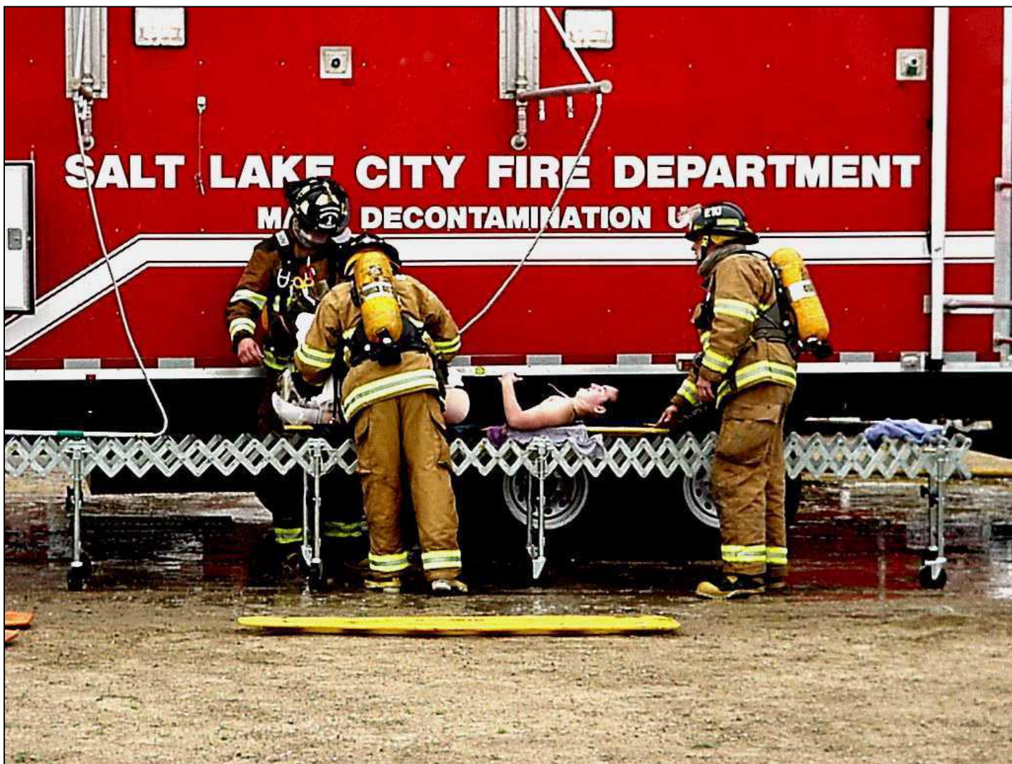
Figure 2: The Homeland Security strategy contains an overall goal on recovering from terrorist attacks, a subordinate objective on emergency preparedness and response, and a specific initiative to prepare for chemical, biological, and nuclear decontamination